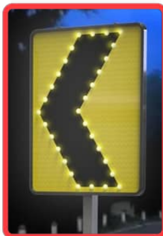
CHEVRON IN RIGHT DIRECTION TO INSTALL IN THE SIDE OF CENTER LANE SEPARATOR