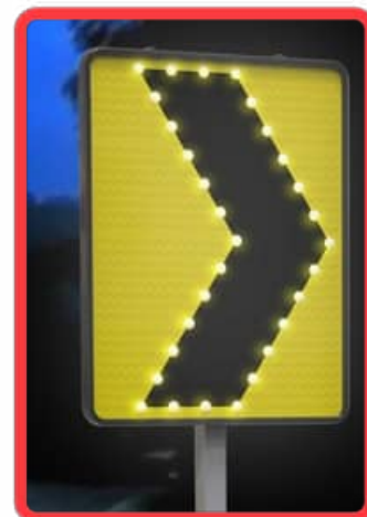
CHEVRON IN LEFT DIRECTION TO INSTALL IN THE SIDE OF SHOULDER (ROAD)