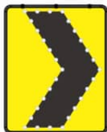
CHEVRON IN RIGHT DIRECTION