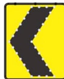
CHEVRON IN LEFT DIRECTION