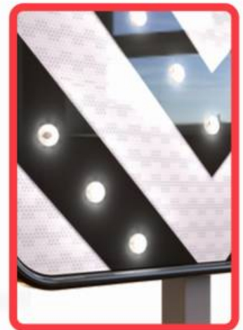
LATEST GEN LED