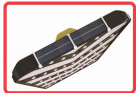
PHOTOCELL MOUNTED ON TOP PART