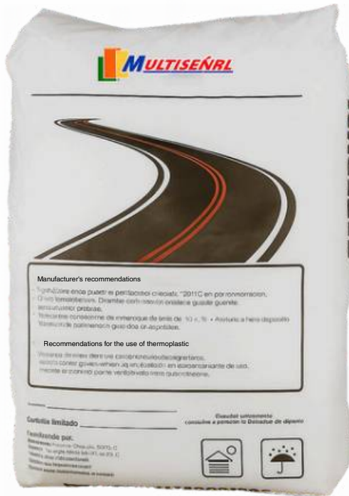
PACKAGING 44.09 lb heat-degradable bag