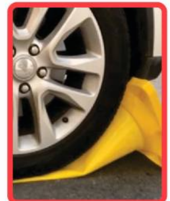
Withstand being run over