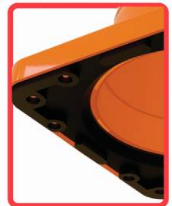
Heavyweight base for greater stability