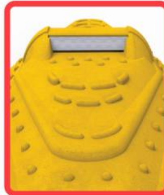
One side with white reflective sheeting