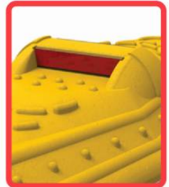
Opposite side with red reflective sheeting