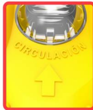
High relief position

These are resistant to weather and don't require constant maintenance, ideal for their use in different urban environments.