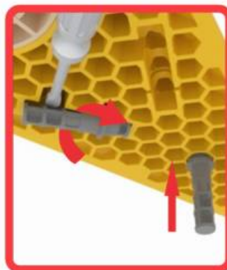
Installation of anchor bolts