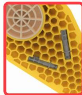
Stored anchor bolts