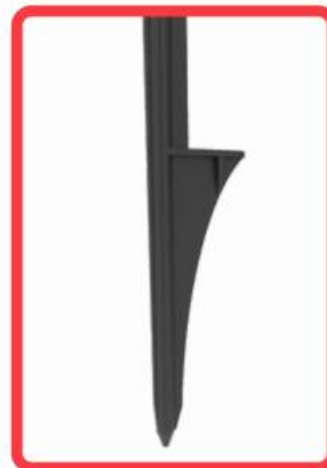
Anchor for installation