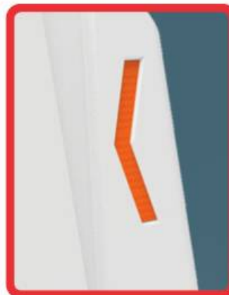
ENGRAVED CHEVRONS IN BODY