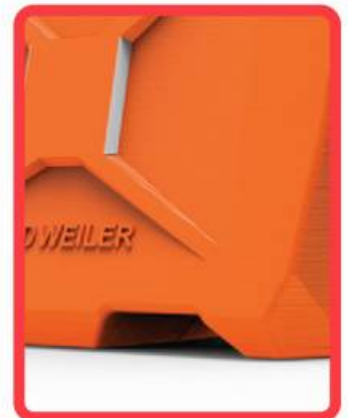
Bridge (water flow)