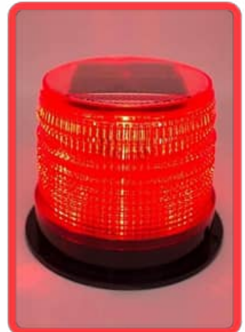
Solar-powered strobe beacon