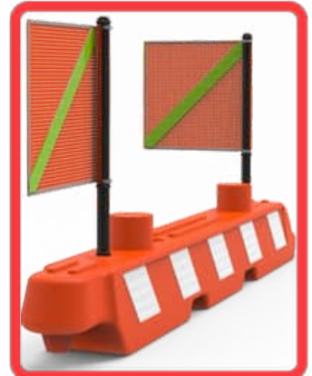
Boreholes for one or two traffic flags