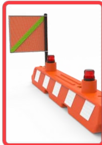
Traffic flag and solar-powered strobe beacons