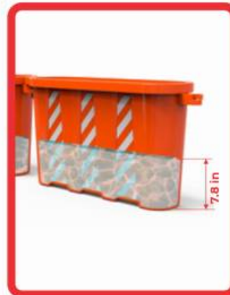
WATER FILLING (maximum of 7.8in)