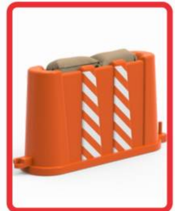
2 SAND BAGS OF 22 LBS EACH (OPTIONAL)