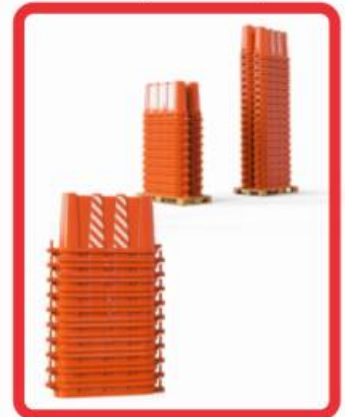
STORE UP TO 75 PCS PER PALLET