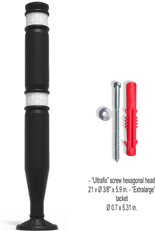
- "Ultrafix" screw hexagonal head 21 v Ø 3/8" x 5.9 in. - "Extralarge" tacket Ø 0.7 x 5.31 in.

Leader don't follow steps ... marks the way