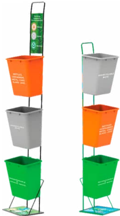
24A VERTICAL BIN STAND